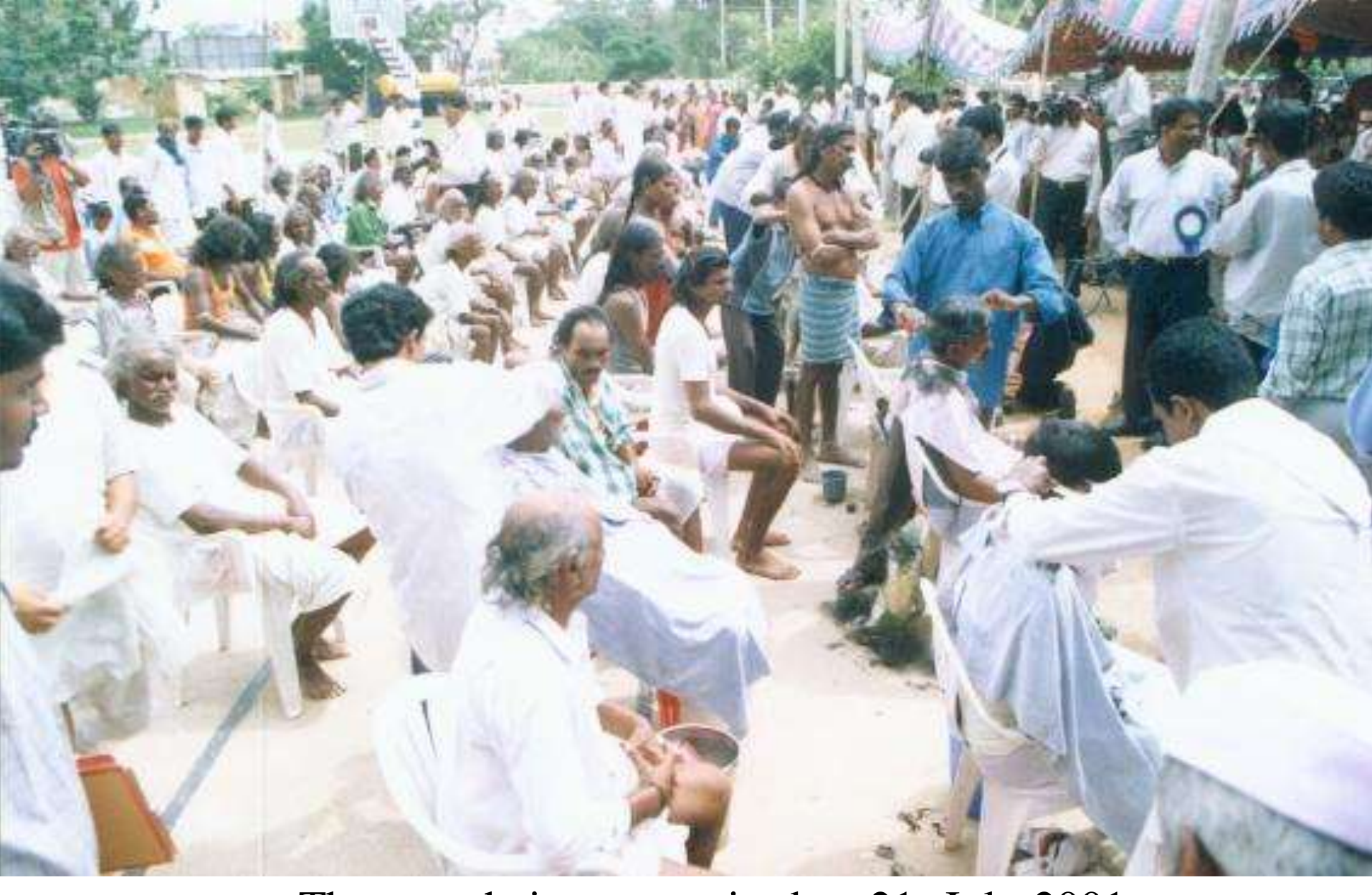
The mass haircut organised on 21- July-2001 "the Barber-ic Act"