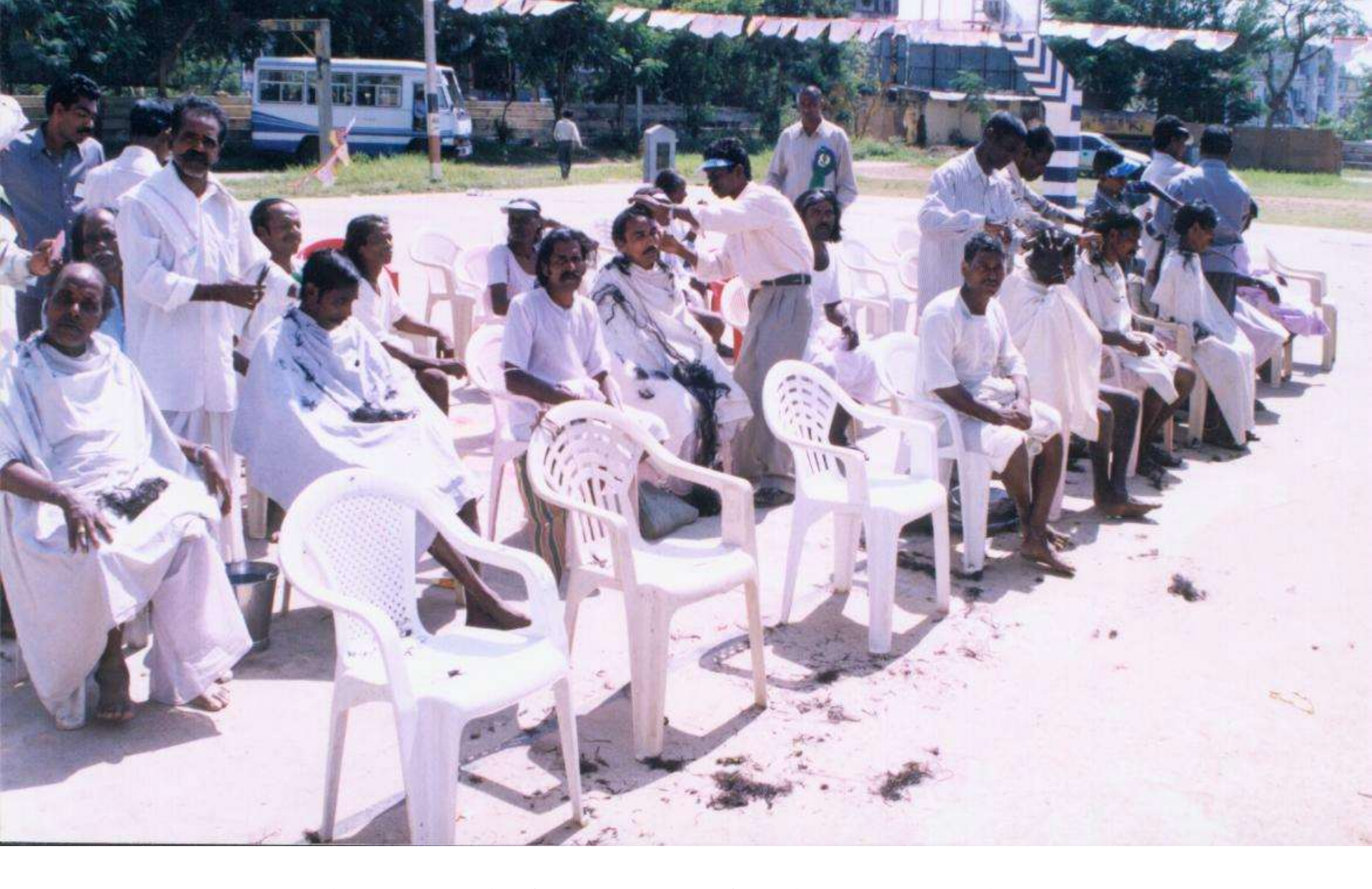
The mass haircut organised on 21- July-2001 "the Barber-ic Act"