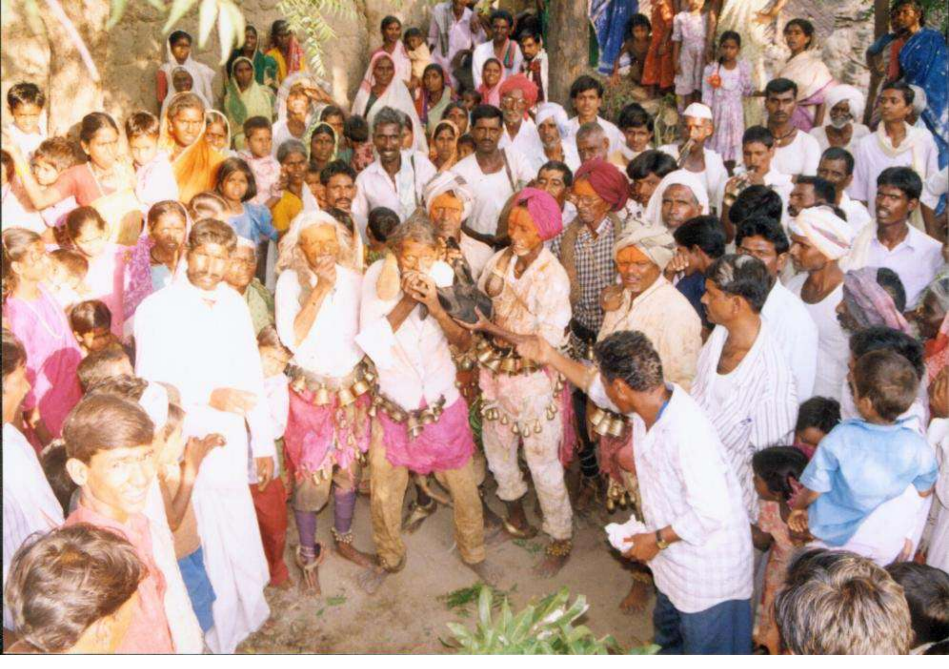
The Real "Barbaric" Act