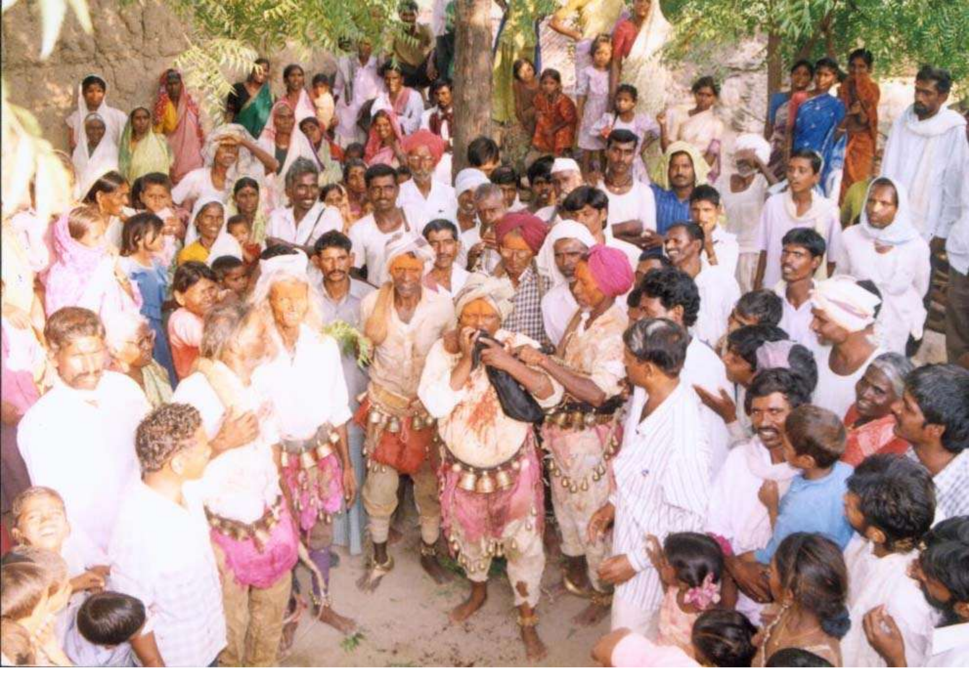
The Real "Barbaric" Act-killing a lamb by biting at its throat