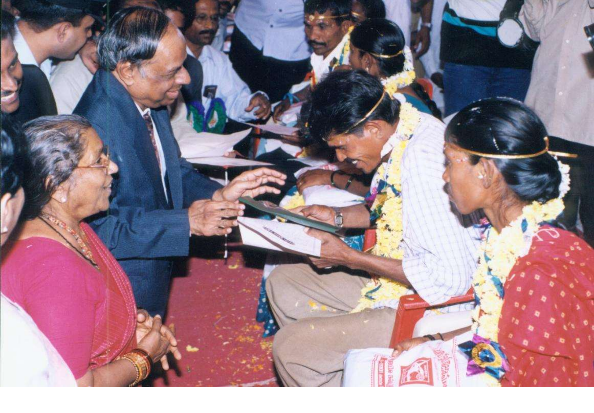
Jogin marriages in presence of Governor and Lady Governor, 28-Oct-2001