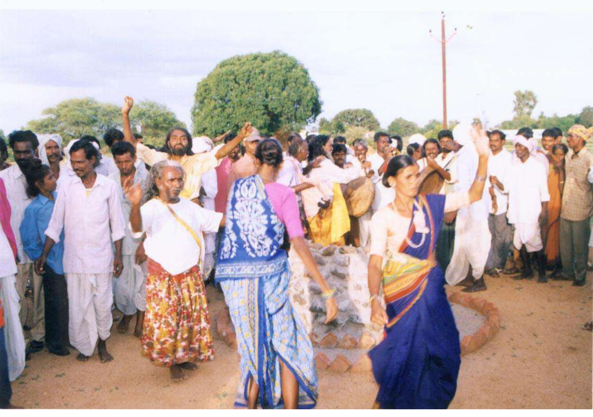
Dancing around the corpse