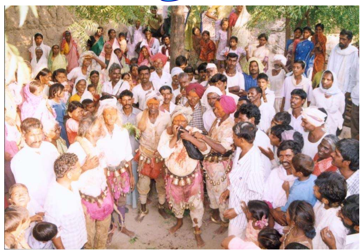
Biting to Kill (a Lamb)— the Gavu Ceremony