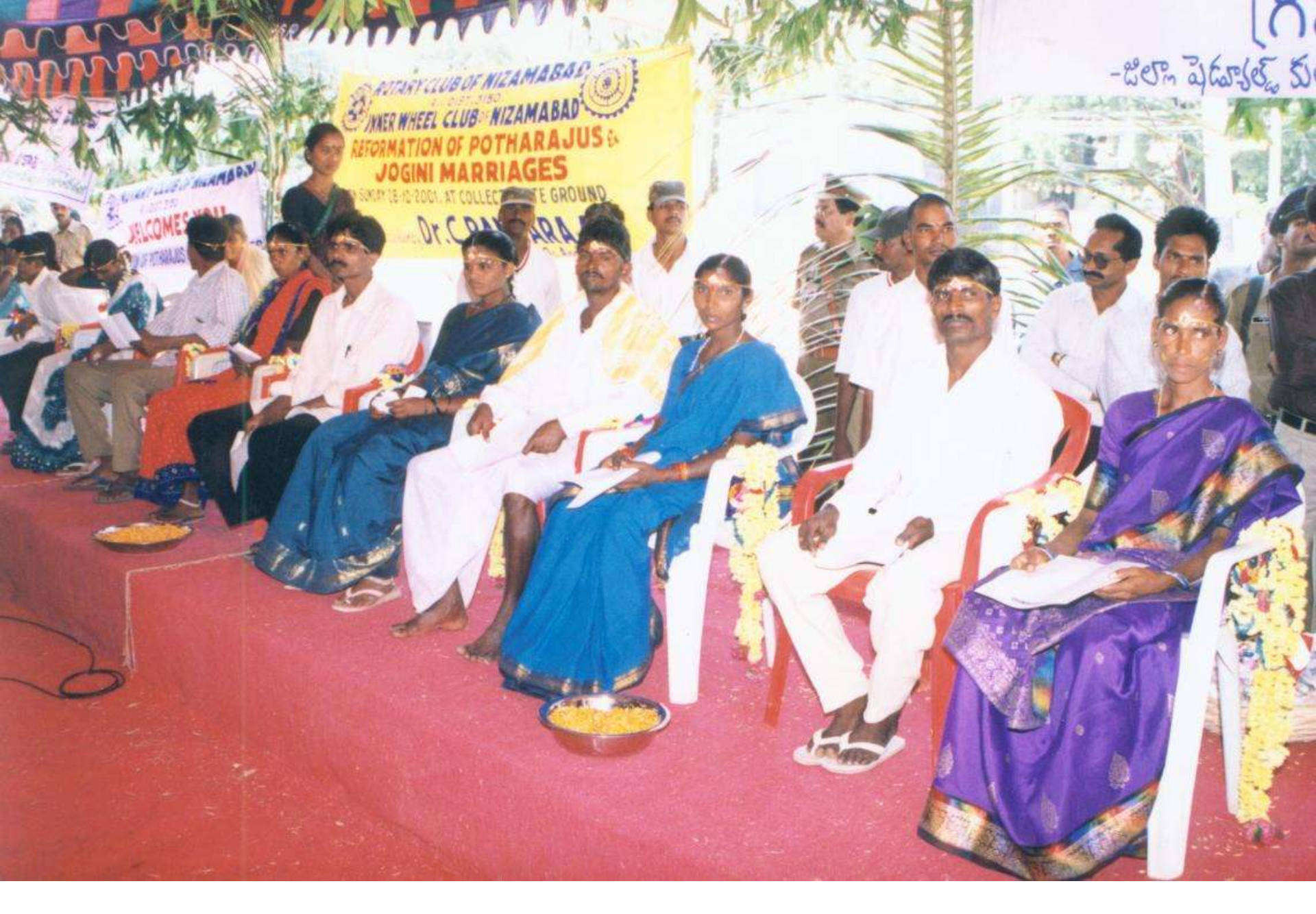
Jogin marriages in presence of Governor and Lady Governor, 28-Oct-2001