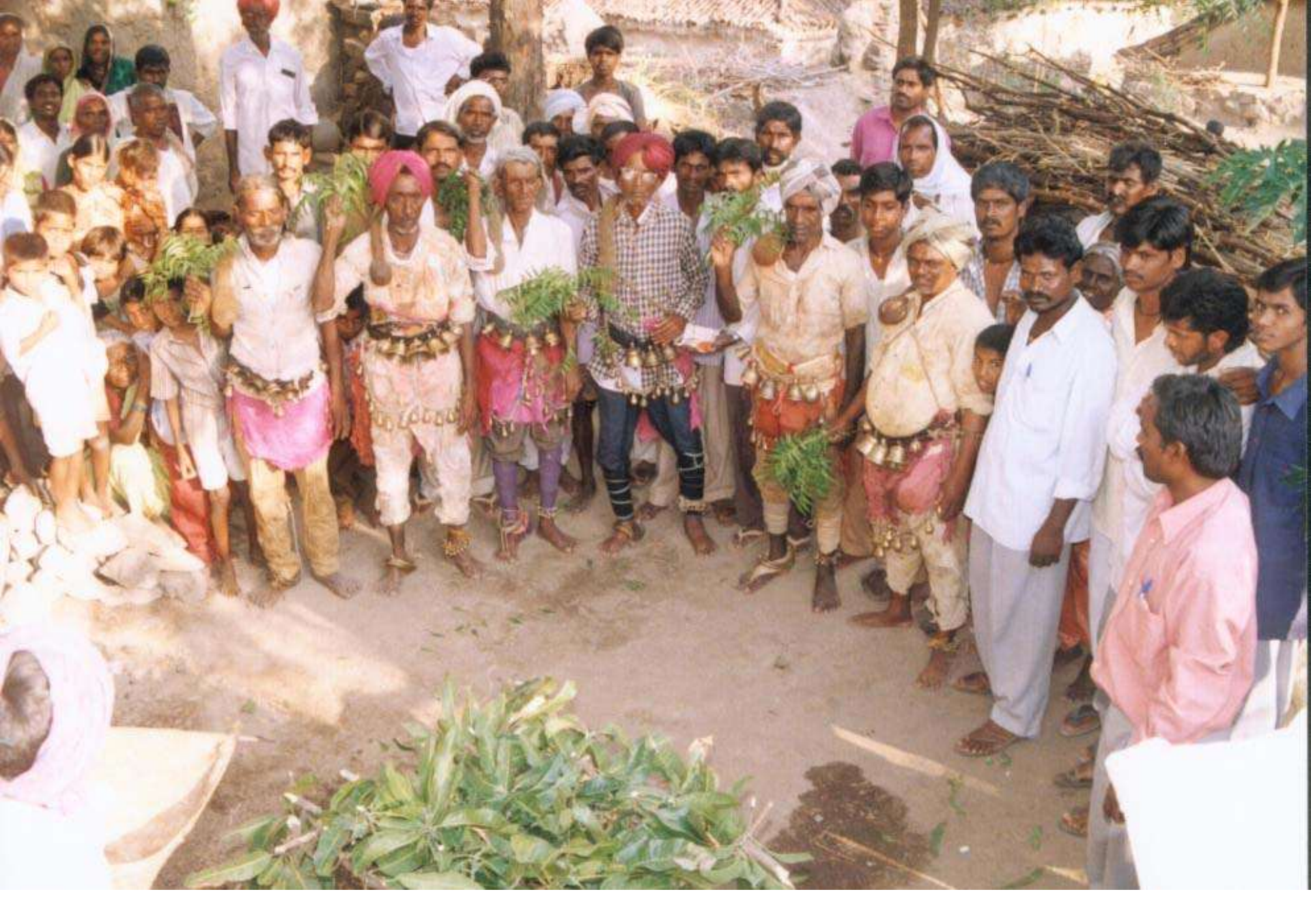
Getting ready for the barbaric acts