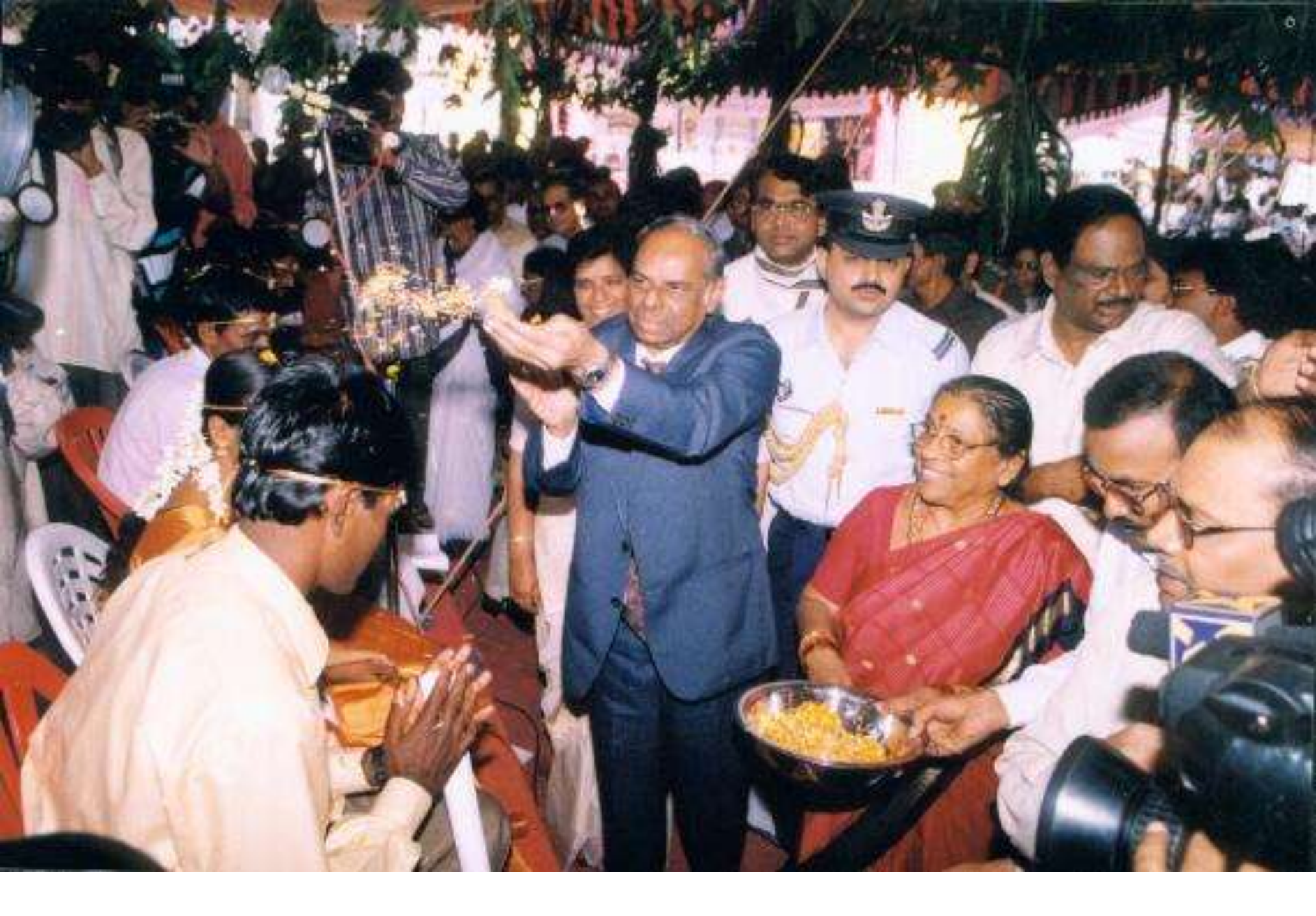
Jogin marriages in presence of Governor and Lady Governor, 28-Oct-2001