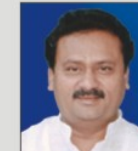
Sri Mohd. Ali Shabbir Hon'ble Minister for Energy, Coal, Minorities Welfare, Wakf & In-Charge Minister for Hyderabad