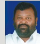
Sri M. Mukesh Goud Hon'ble Minister for BC Welfare