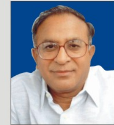
Sri S. Jaipal Reddy Hon'ble Union Minister for Urban Development, Govt. of India