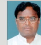
Sri Ponnala Lakshmaiah Hon'ble Minister for Major and Medium Irrigation