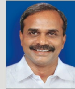
Dr. Y.S. Rajasekhara Reddy Hon'ble Chief Minister Andhra Pradesh