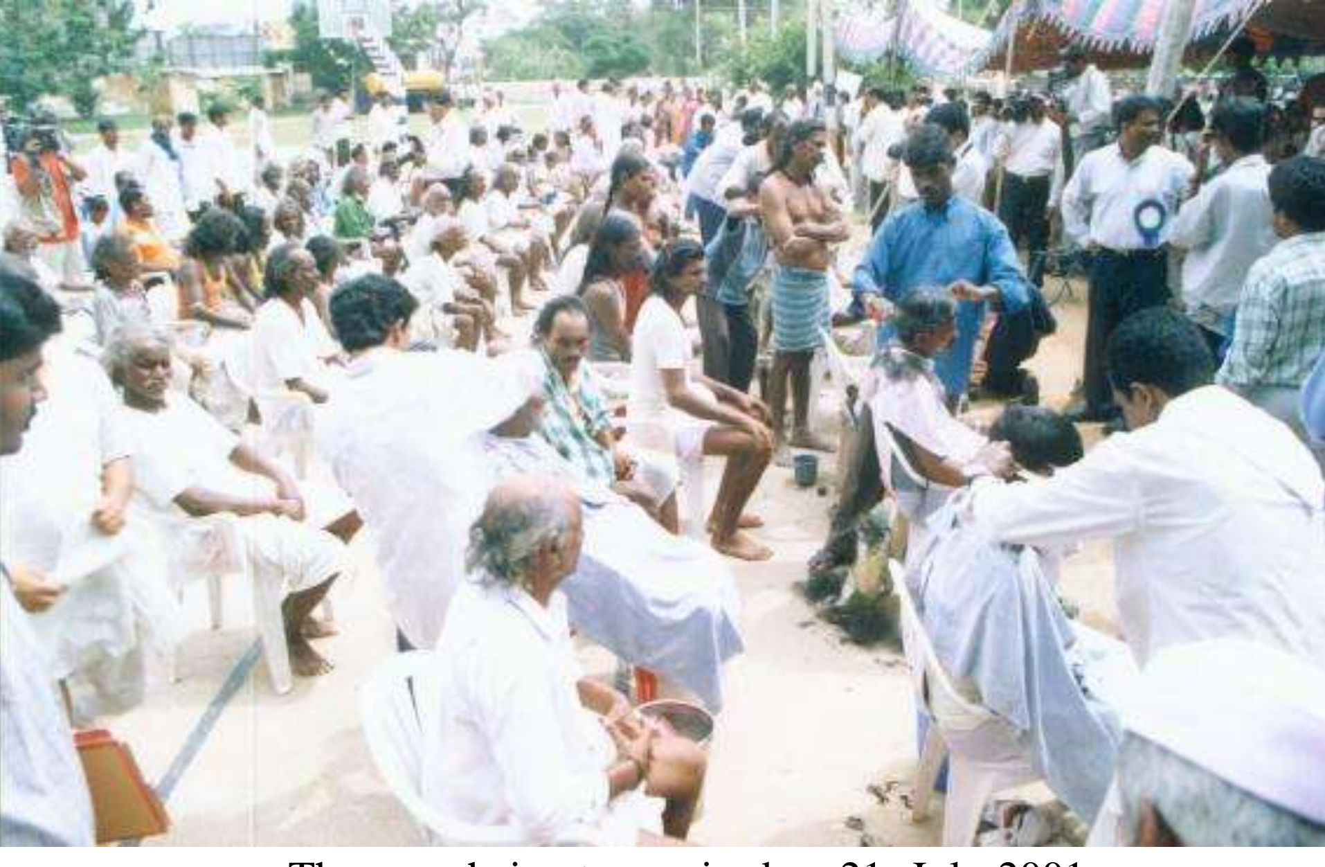
The mass haircut organised on 21- July-2001