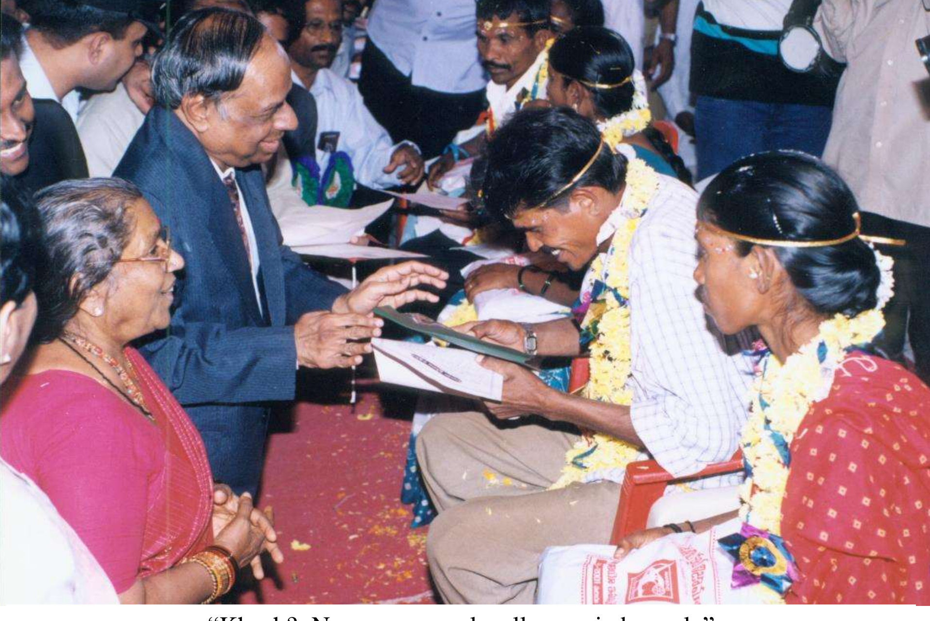
"Khush?, Now you are a legally married couple"

Certificate of registration of marriage to the couples from the Governor, 28-Oct-2001