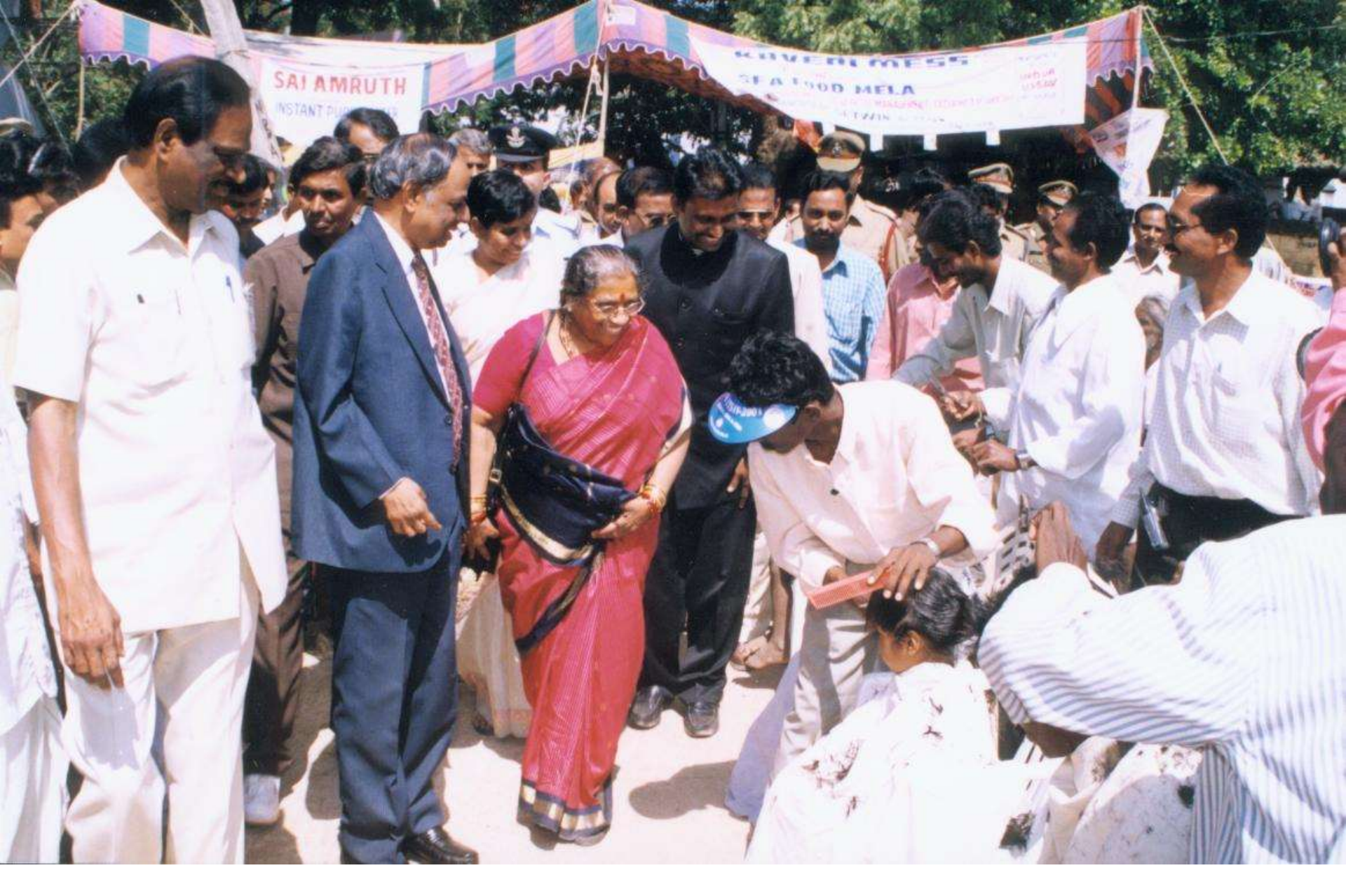
The mass haircut organized on 28-October-2001 in presence of Mrs and Mr Rangarajan, Governor of AP