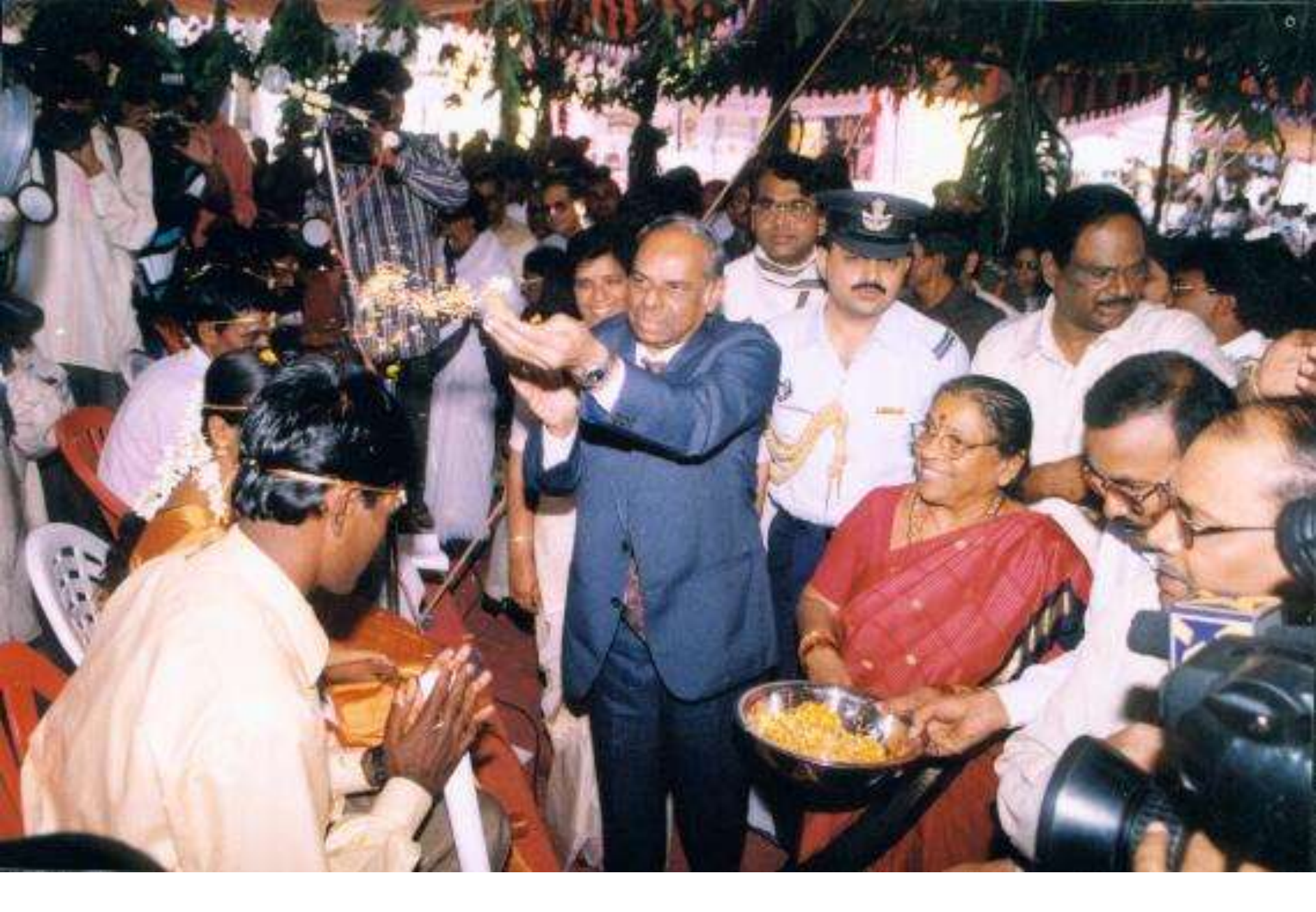
Blessings to the couples from Governor and Lady Governor, 28-Oct-2001