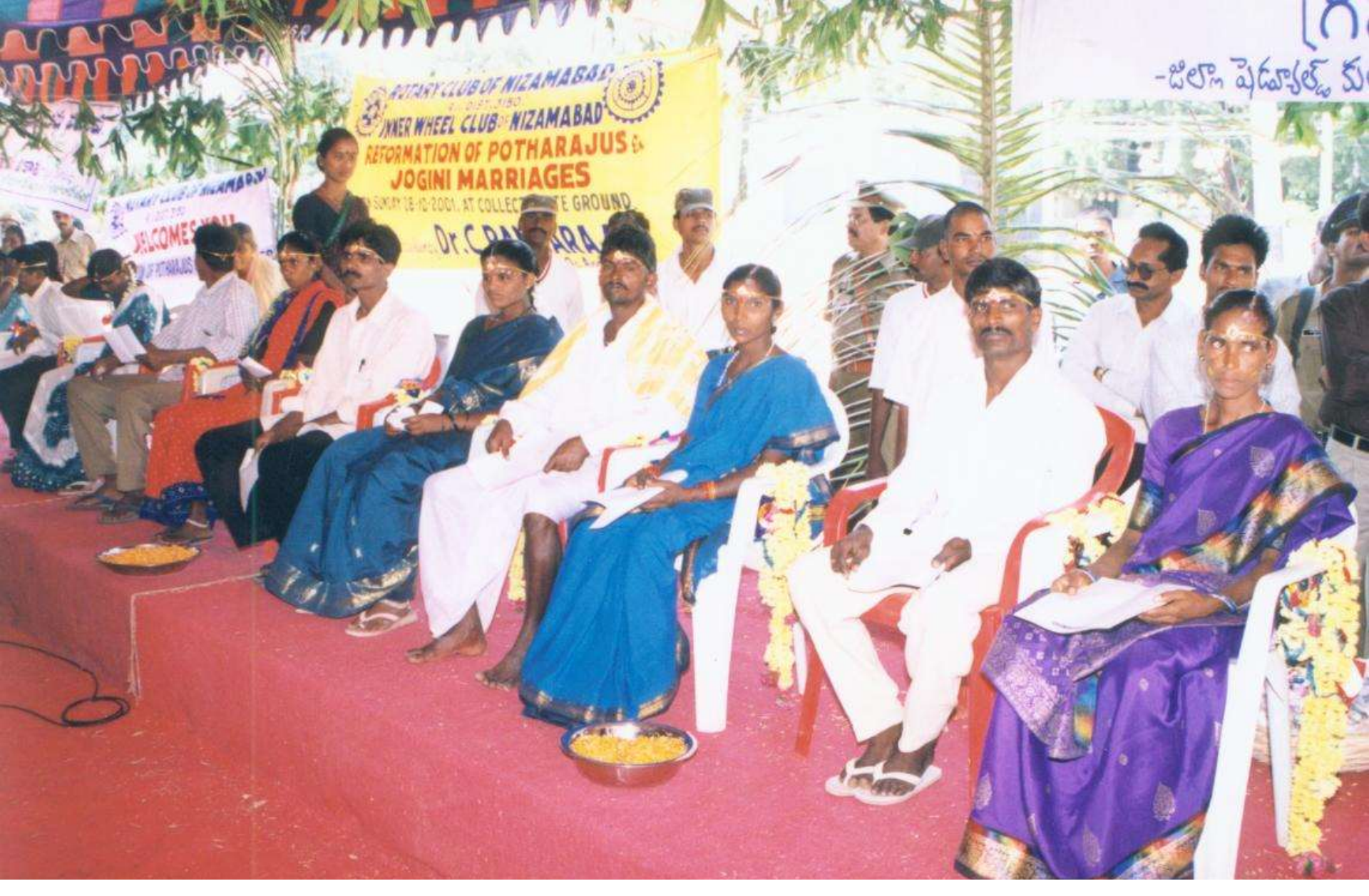
Turning point in the life of Jogins