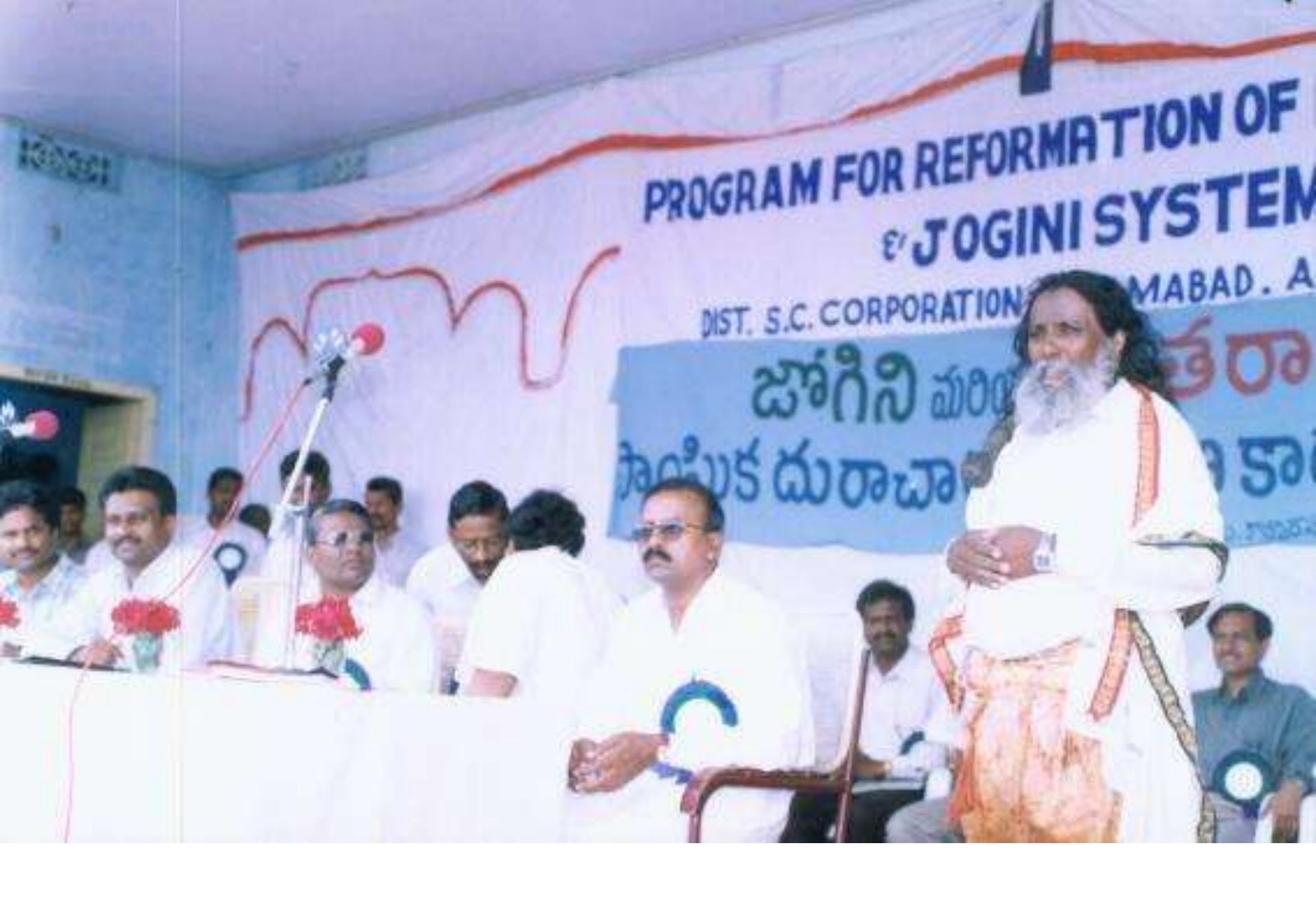
A major social reform- meeting on 21-July-2001 for "relinquishing magical powers"