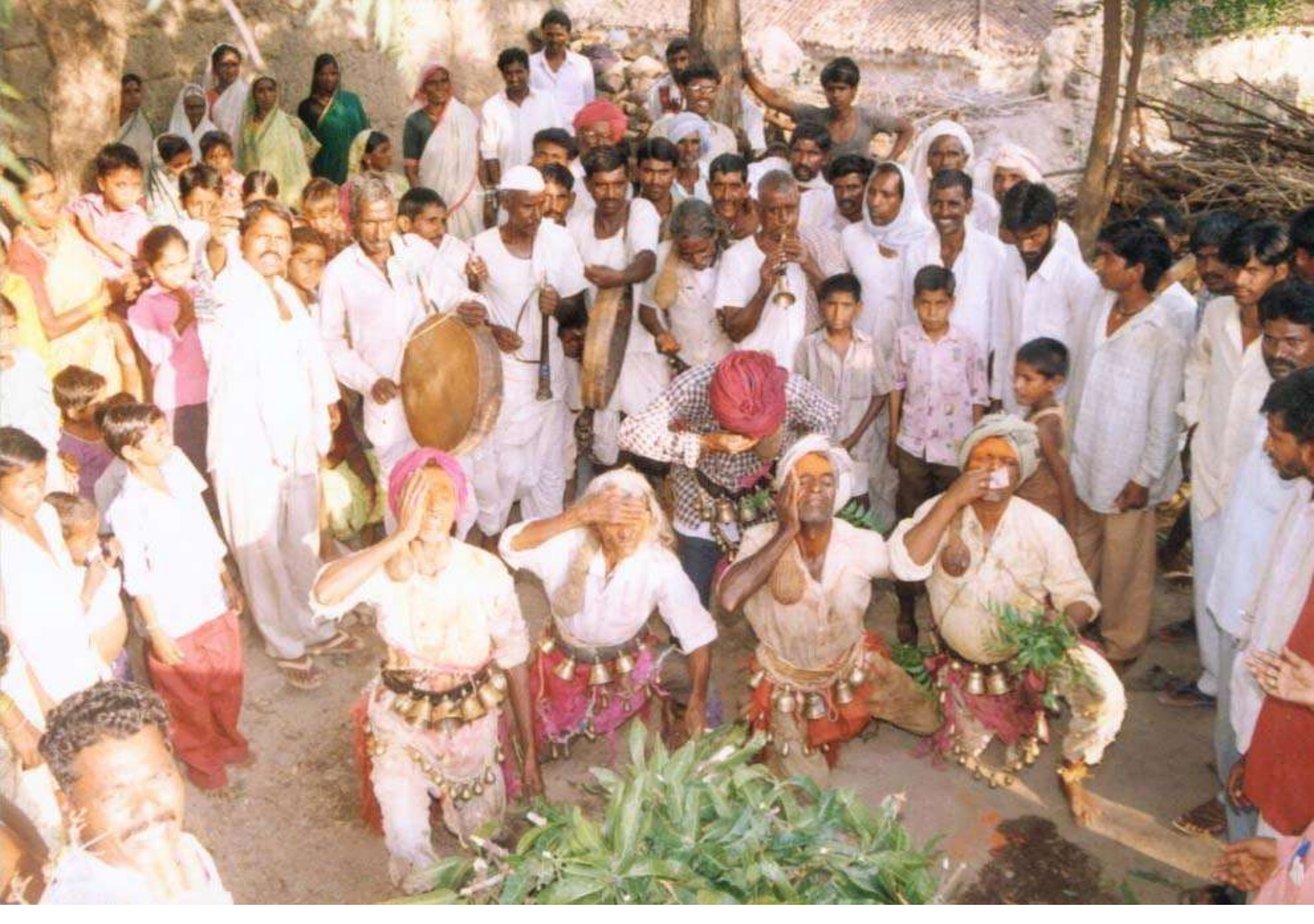
Ash facials before the performance!