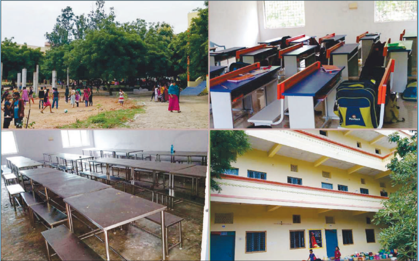
Infrastructure facilities in MJPTBCWR School, Keesara