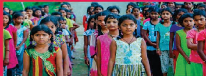
MJPTBCWR School (G), Yamzal