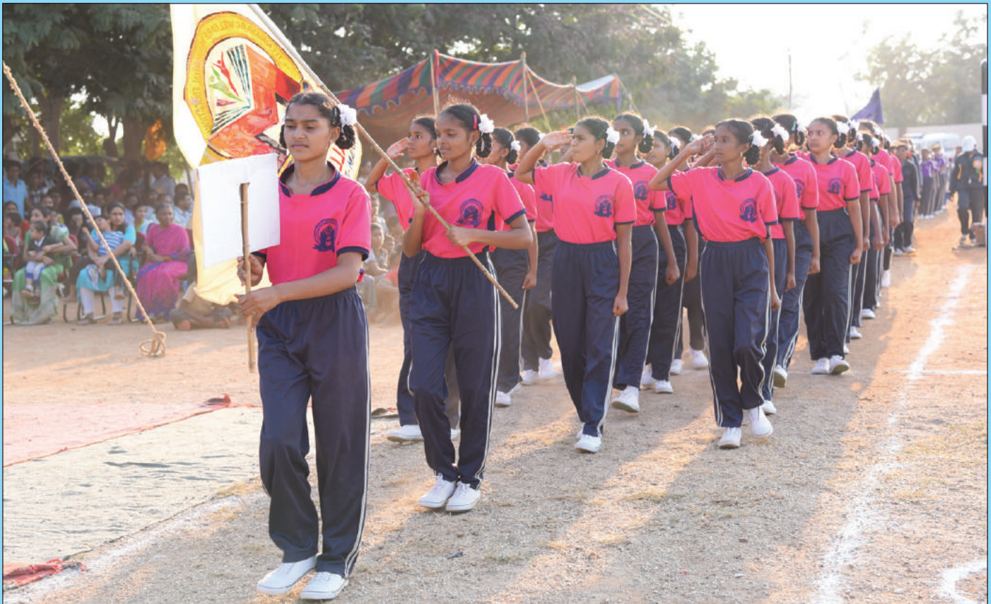
March past at Sports meet 2017