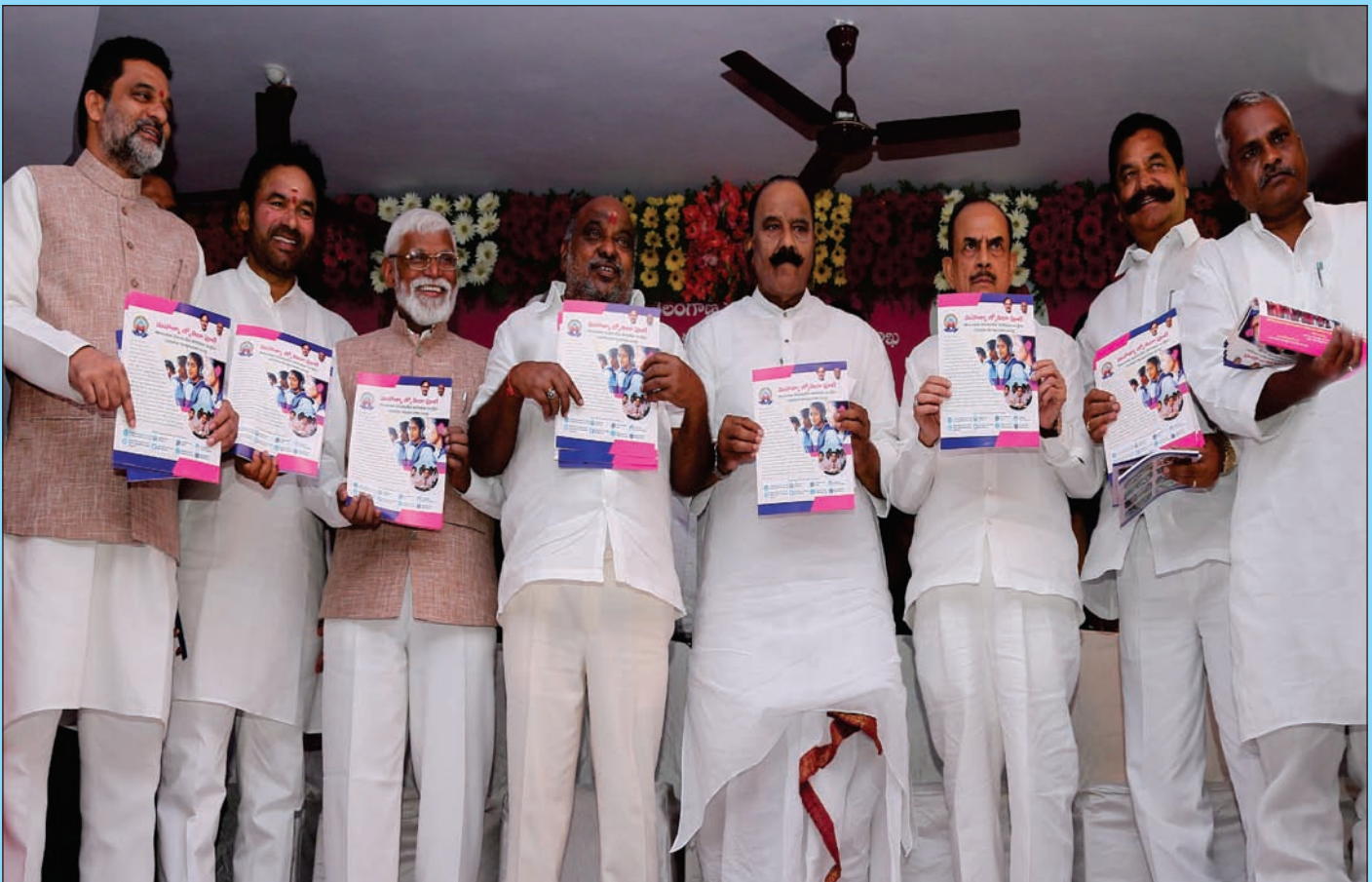
Releasing of MJP Academic Calender 2017