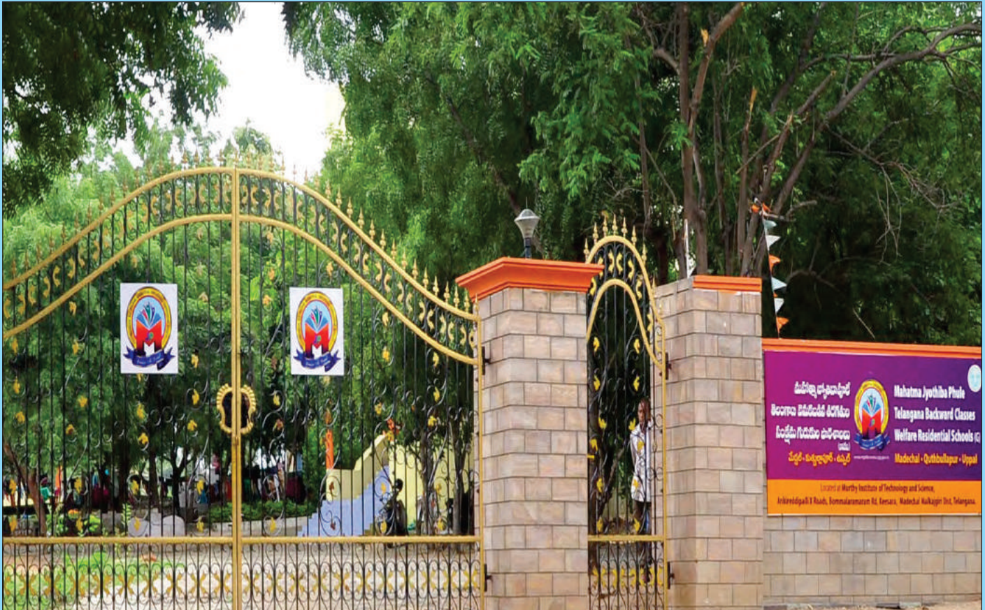
MJPTBCWR School (G), Medchal.