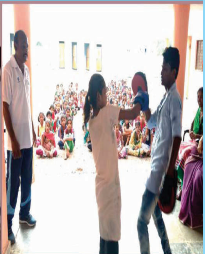
Self Defence Training