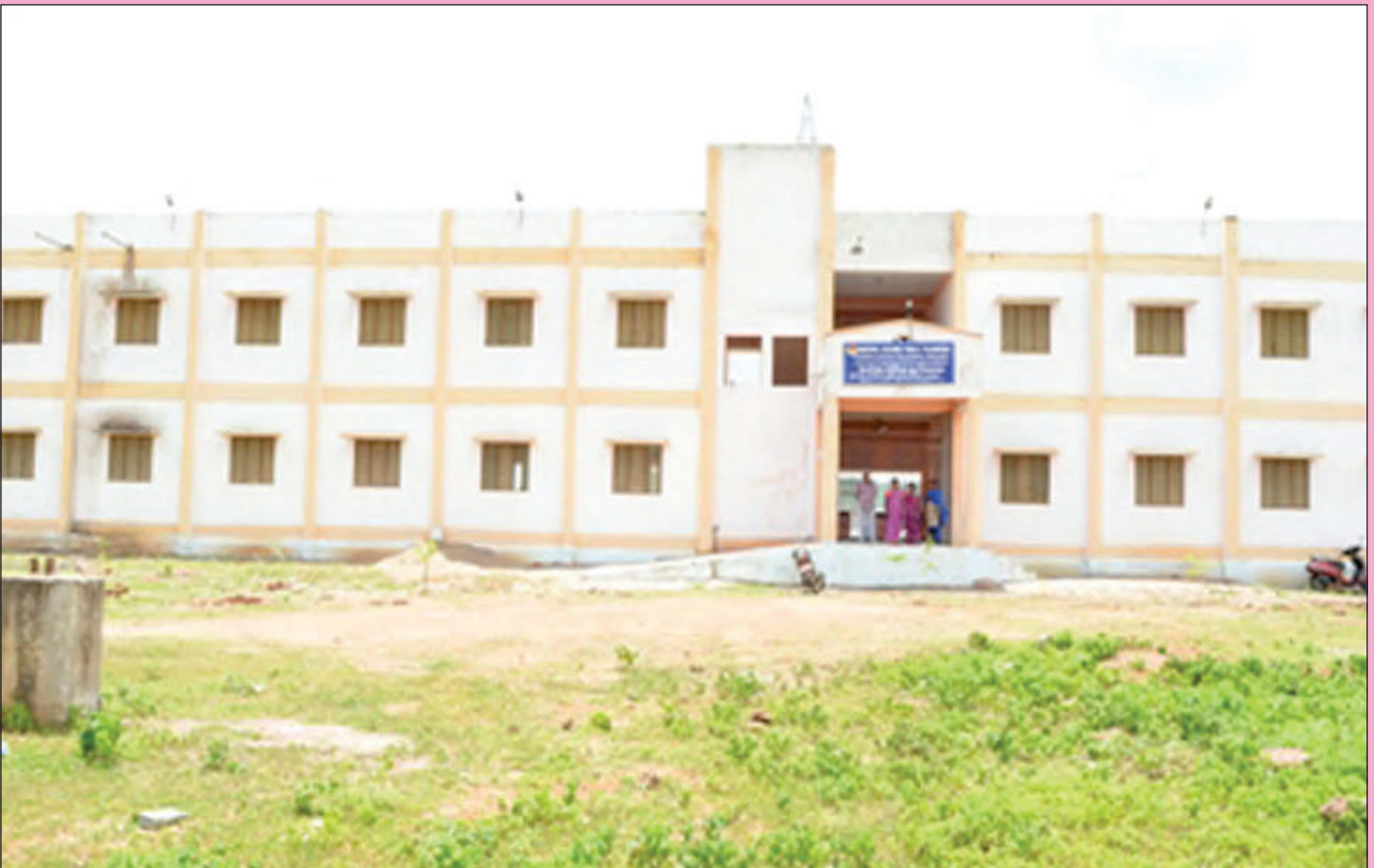
MJPTBCWR School (G), Kagaznagar.