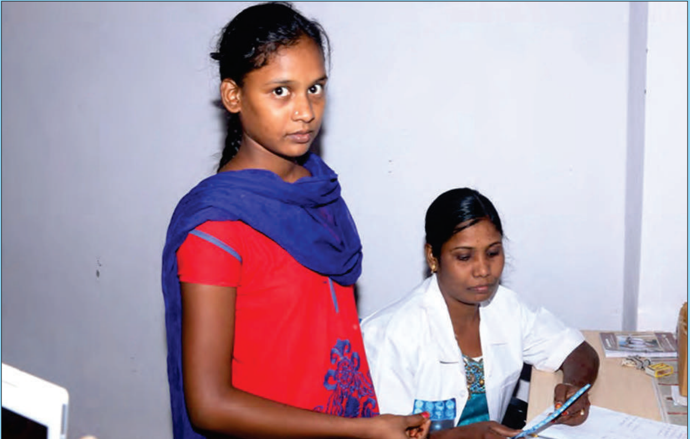
Prompt Medical Care in School