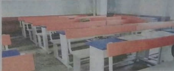
Upscale classrooms in BC residential schools • ARRANGEMENT

Major challenge Right from identifying suitable premises, procuring classroom furniture, providing infrastructure and re-