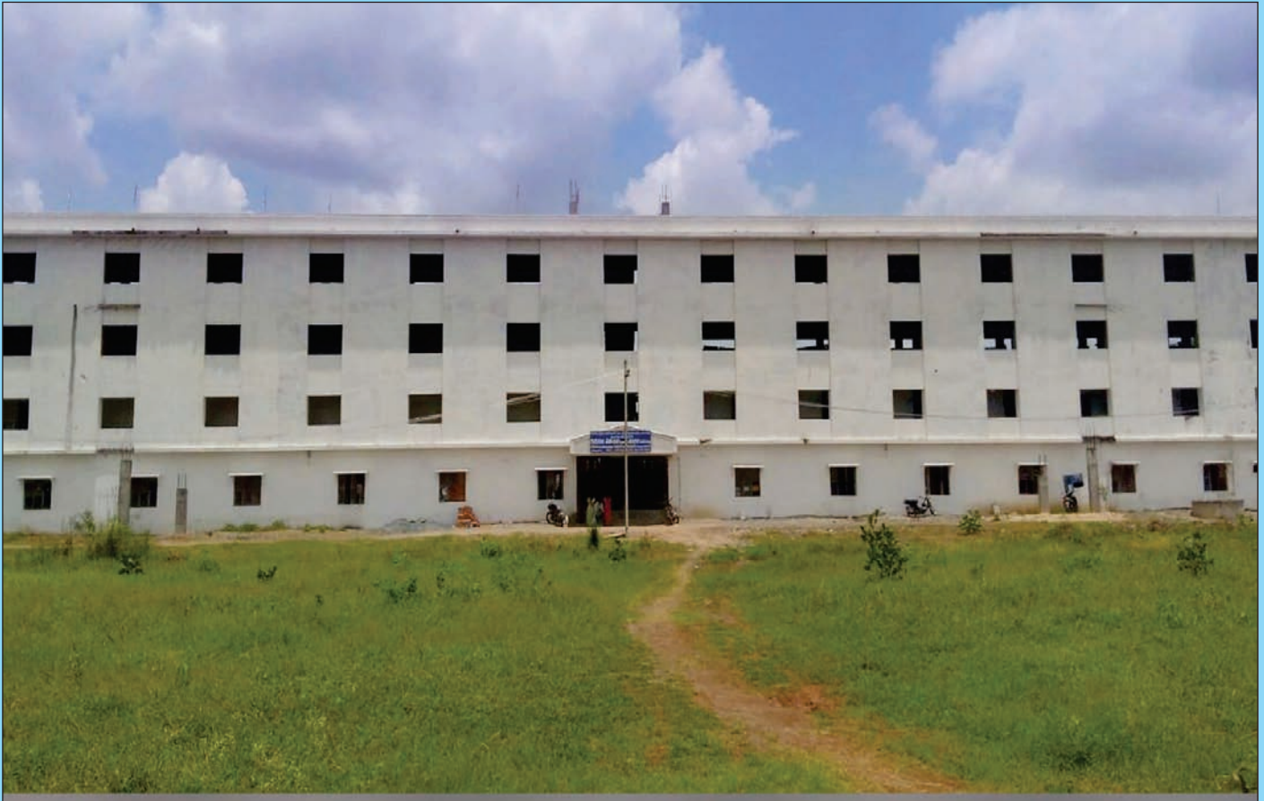
MJPTBCWR School (G), Atmakur, Warangal.