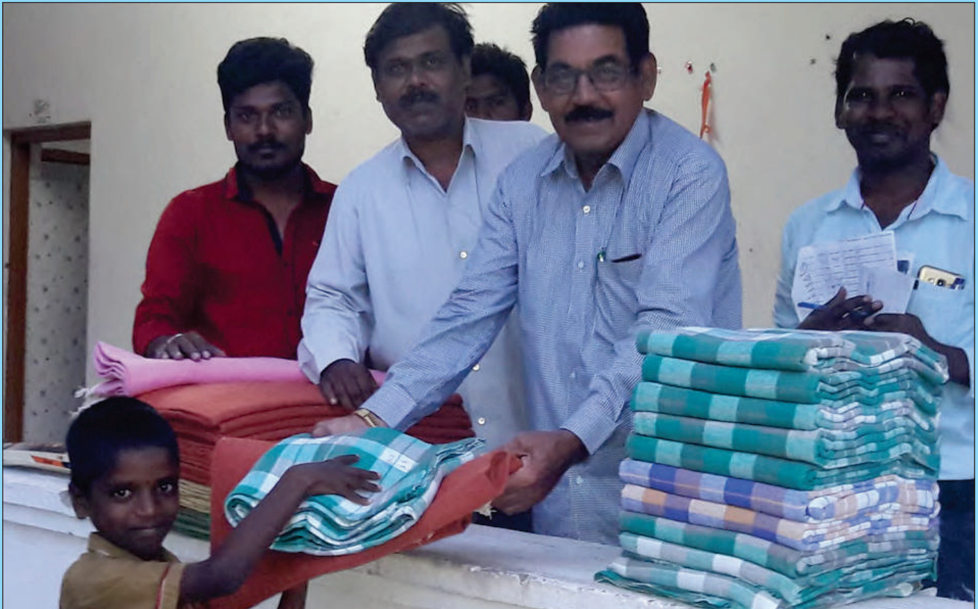
Distribution of Bed Sheets