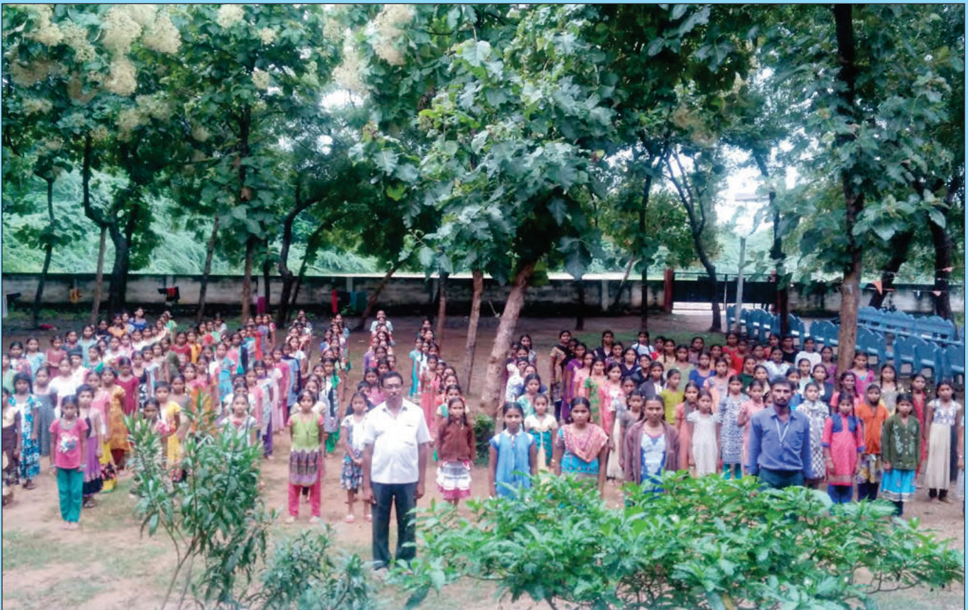
Morning Assembly at Kodad