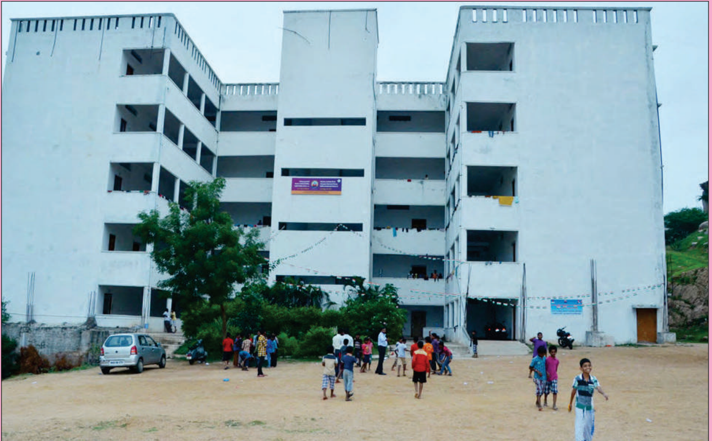
MJPTBCWR School (B), L.B. Nagar