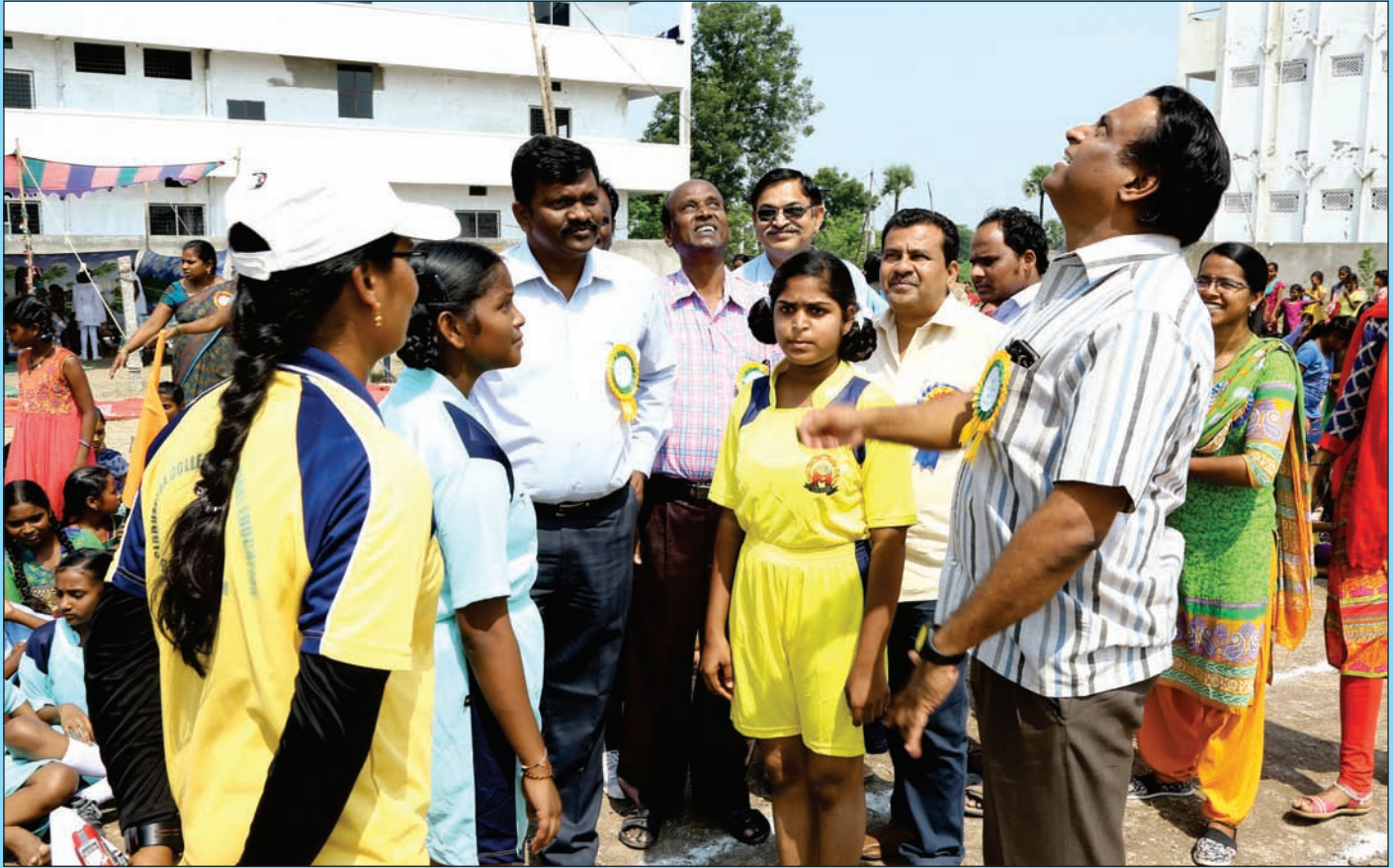
District Level Sports Meet 2017 inauguration