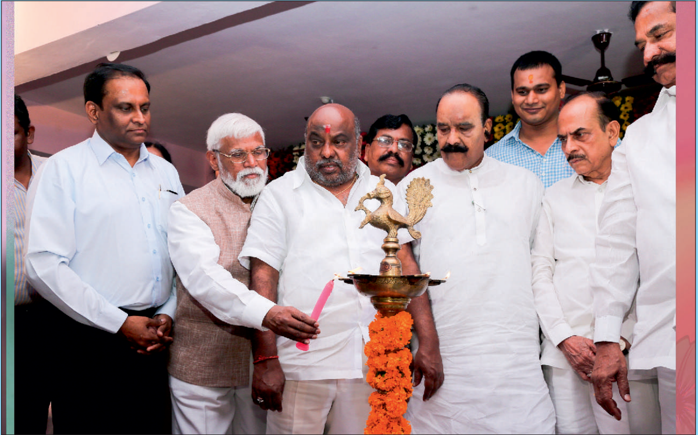
Lighting of the lamp