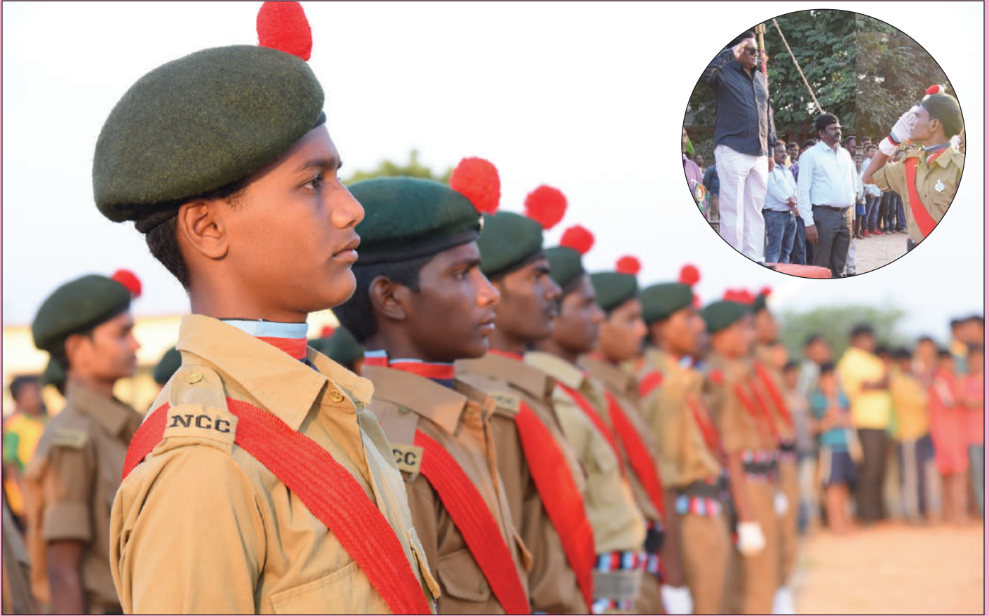
State Level Sports Meet 2017 - Guard of Honour