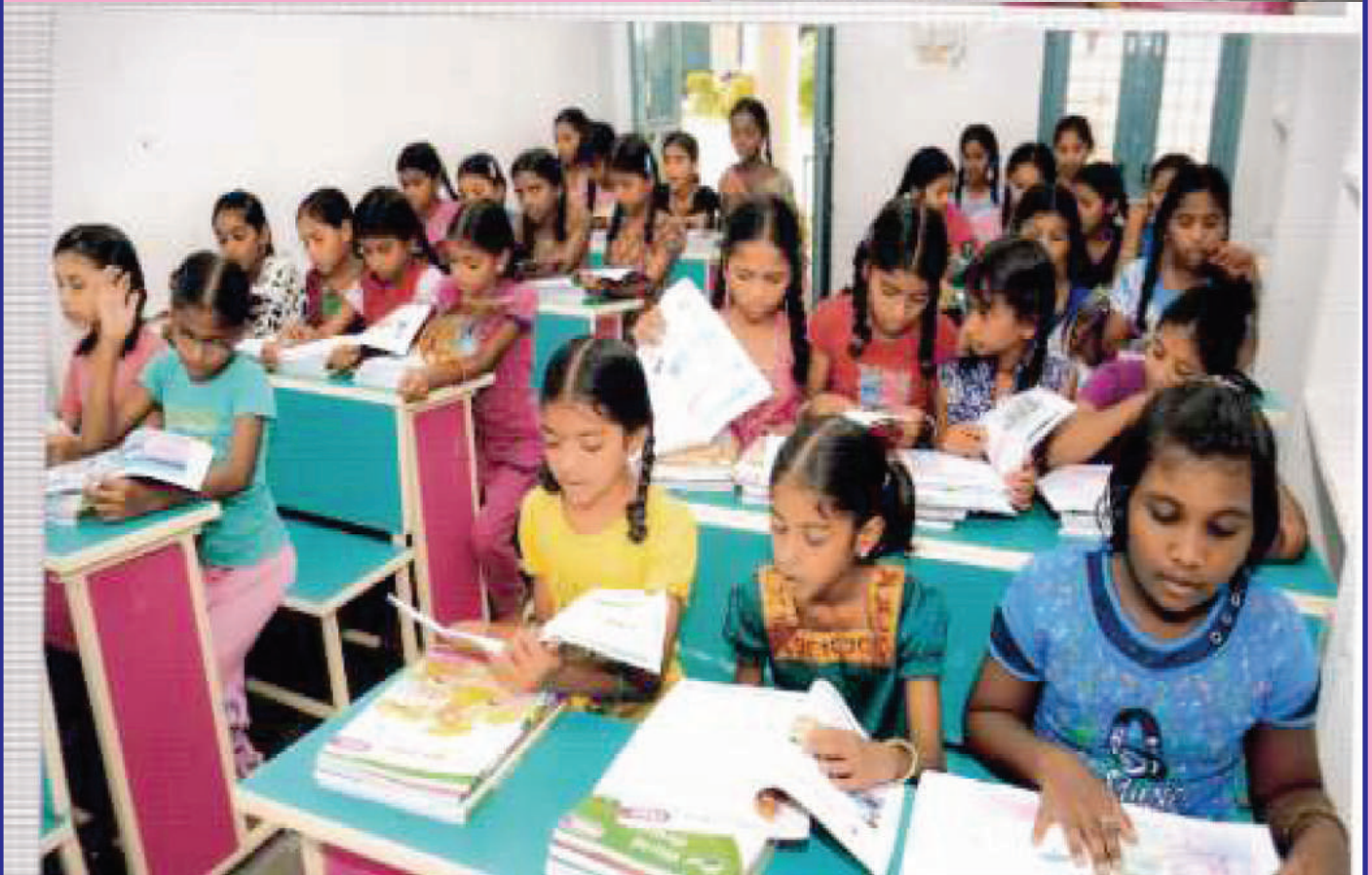
MJPTBCWR School (G), Nalgonda.