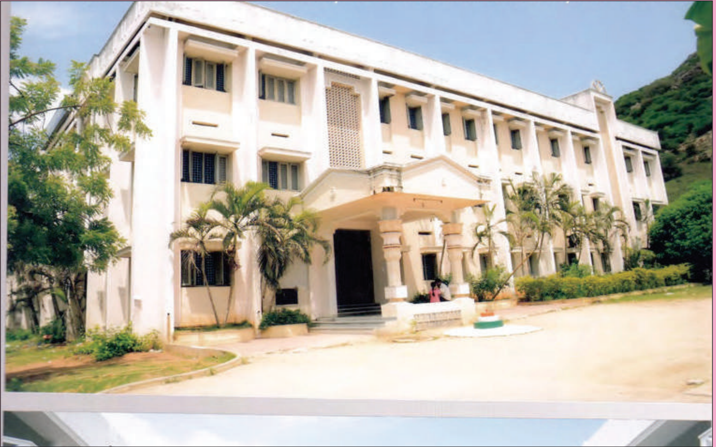
MJPTBCWR School (G), Nalgonda.