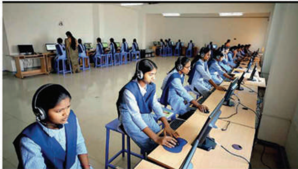
< PRESS ENTER Computer labs at a state-run boarding school