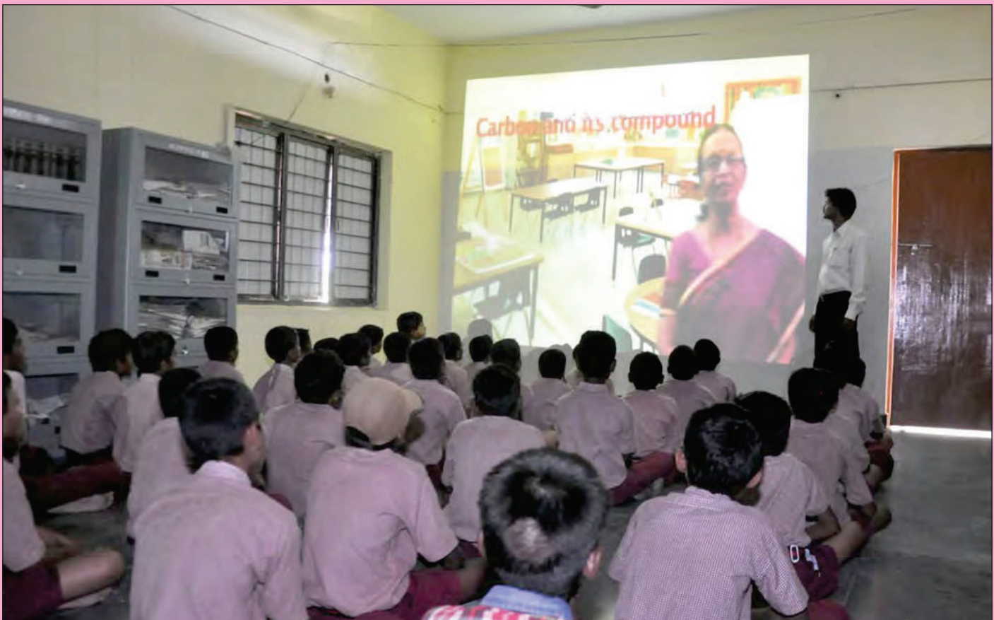
Digital Class Room