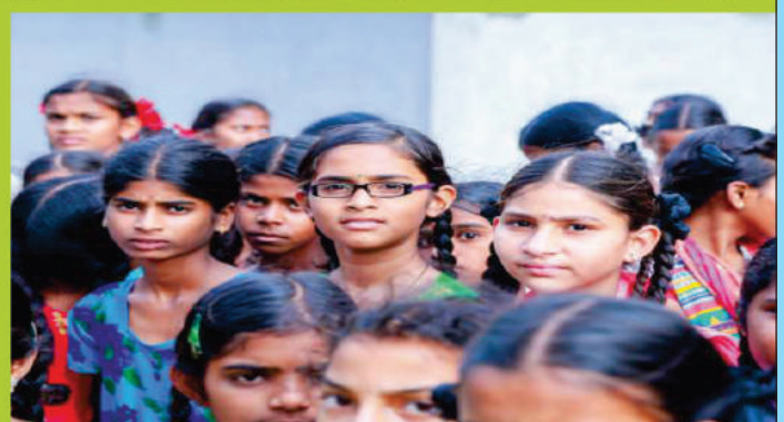
MJPTBCWR School (G), Yamjal