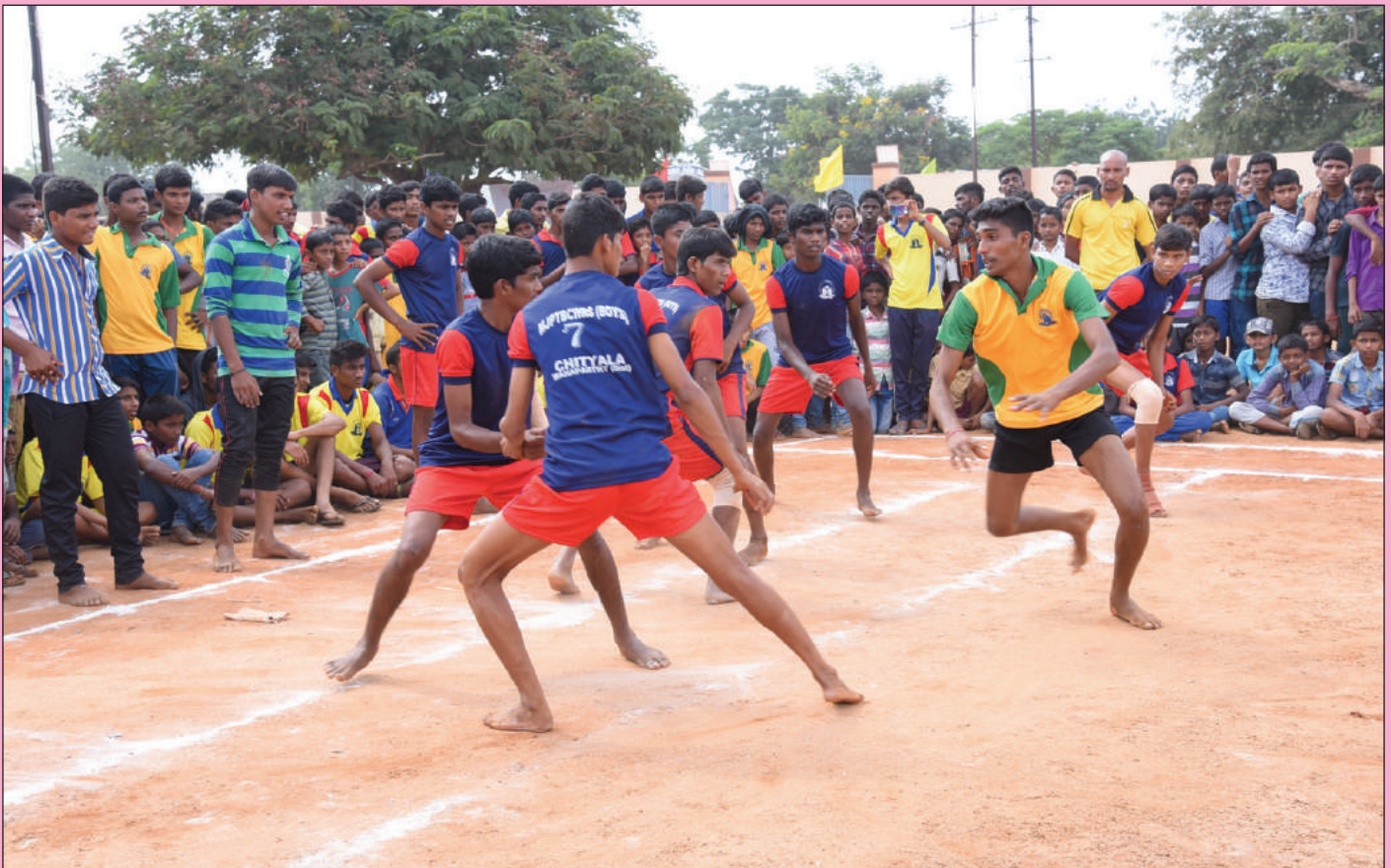
Kabbadi Game in progress