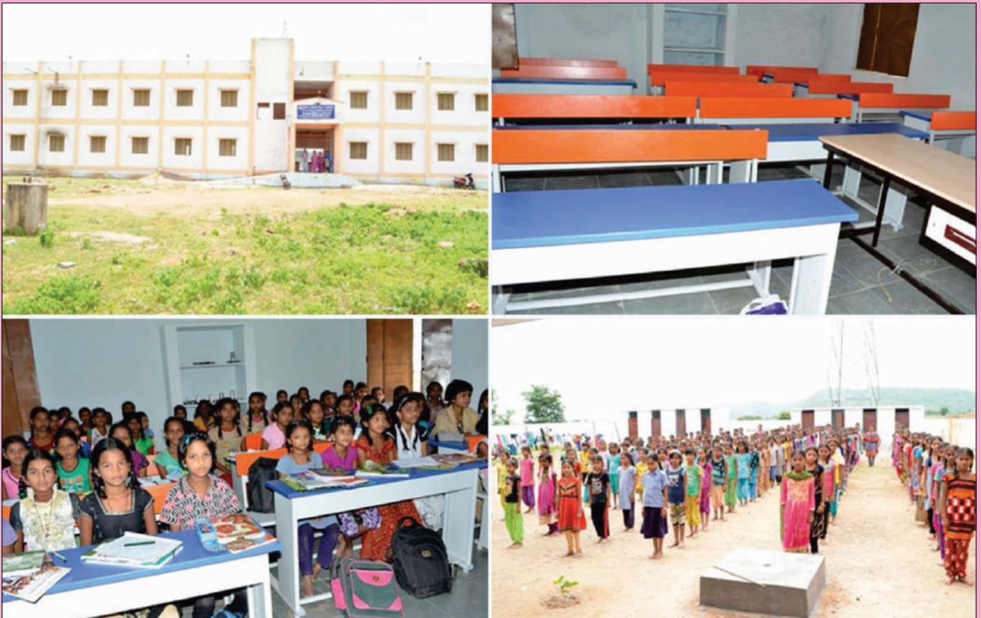
MJPTBCWR School (G), Kagaznagar