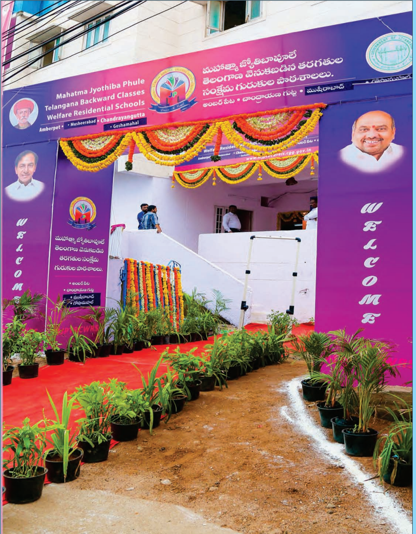
State level inaugural program at Saroornagar