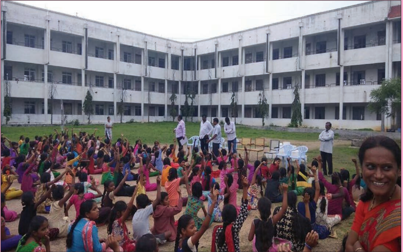
MJPTBCWR School (G), Miryalguda