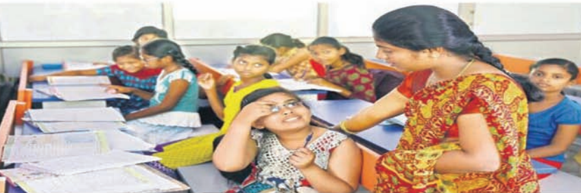
INDIVIDUAL ATTENTION: A teacher leaning the shoulder of a girl student in a residential school.

With over 28,600 students enrolled in the 119 new BC welfare residential institutions, the State government is going all out to bring in the desired change in institutions