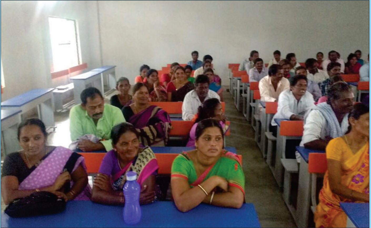
Parents Meeting in progress