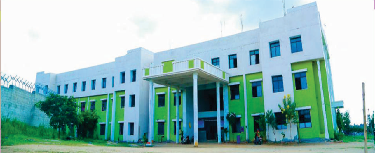
MJPTBCWR School (G), Ibrahimpatnam