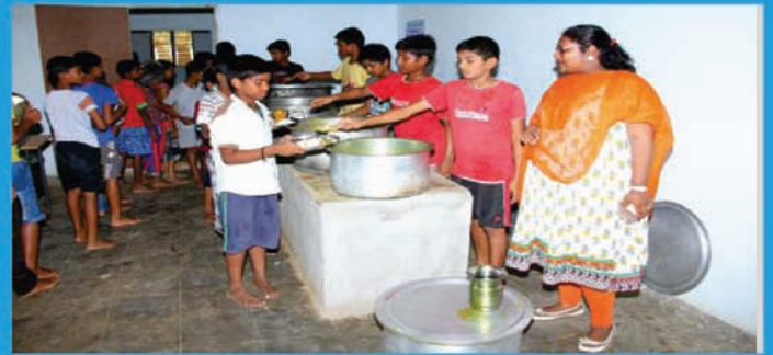
MJPTBCWR School (B), Ghatkesar