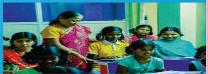
MJPTBCWR School (G), Nagole