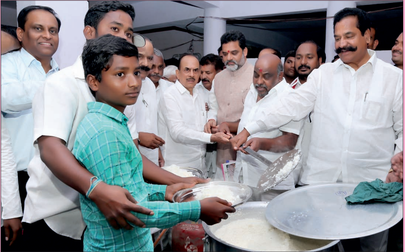
Hon'ble Dy. CM, Home Minister and BC Welfare Minister serving food