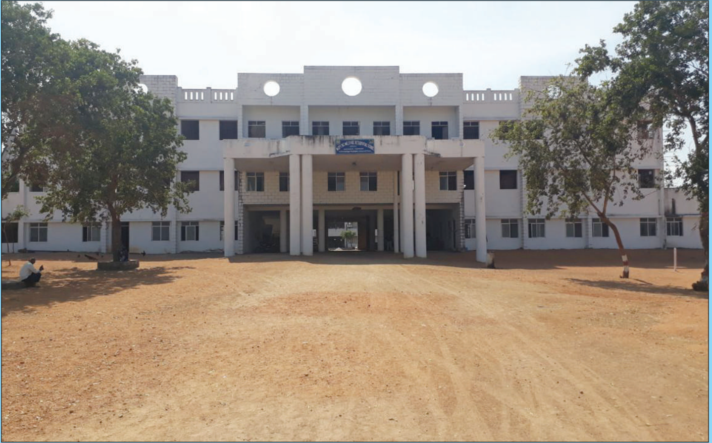
MJPTBCWR School (G), Miryalaguda.