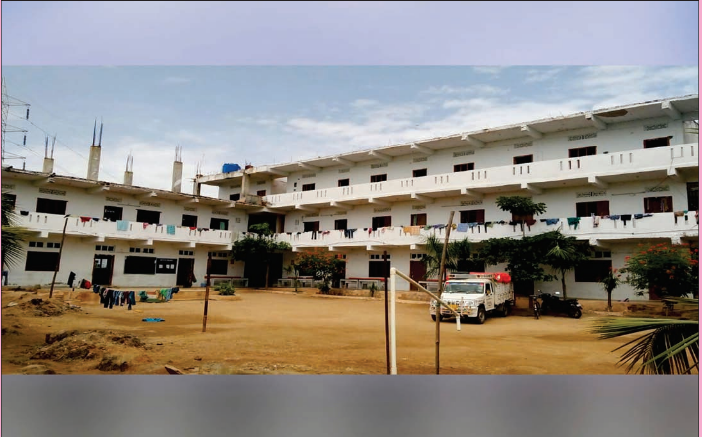
MJPTBCWR School (G), Sangareddy.