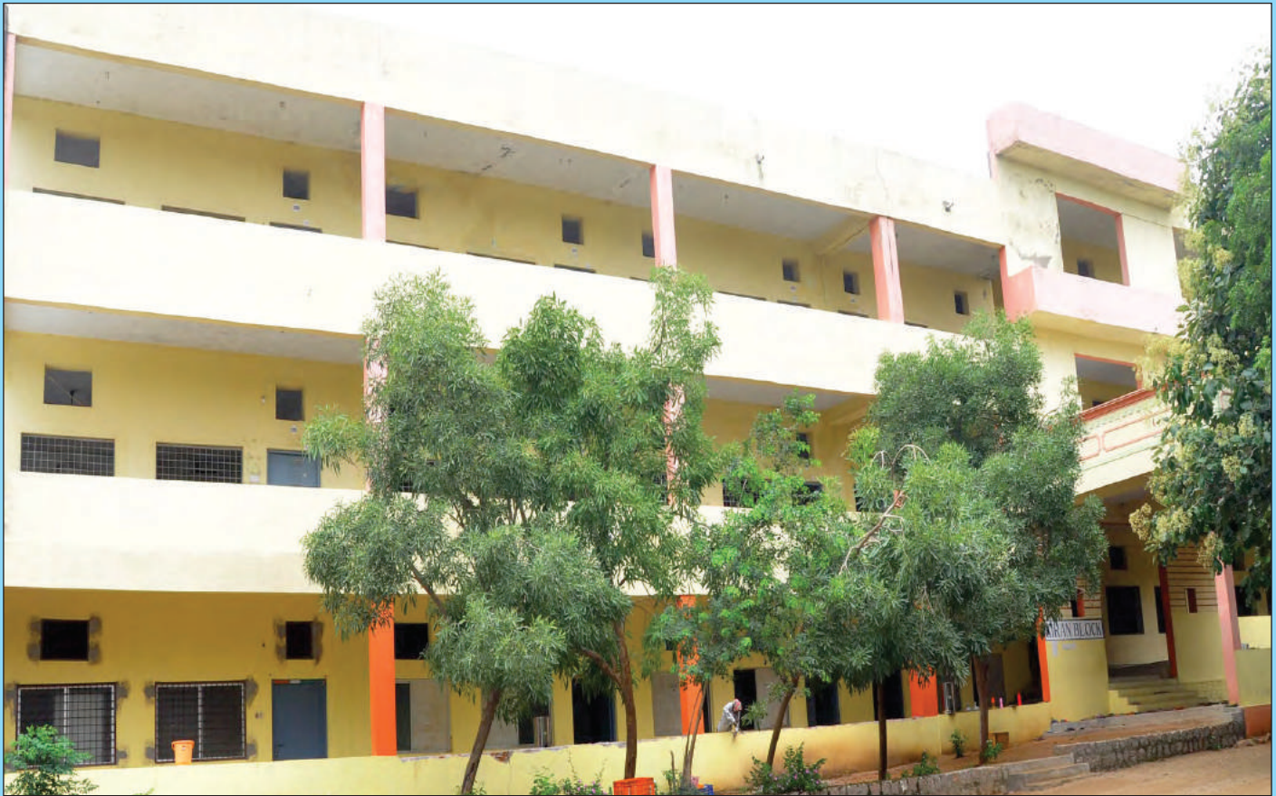
MJPTBCWR School (G), Medchal