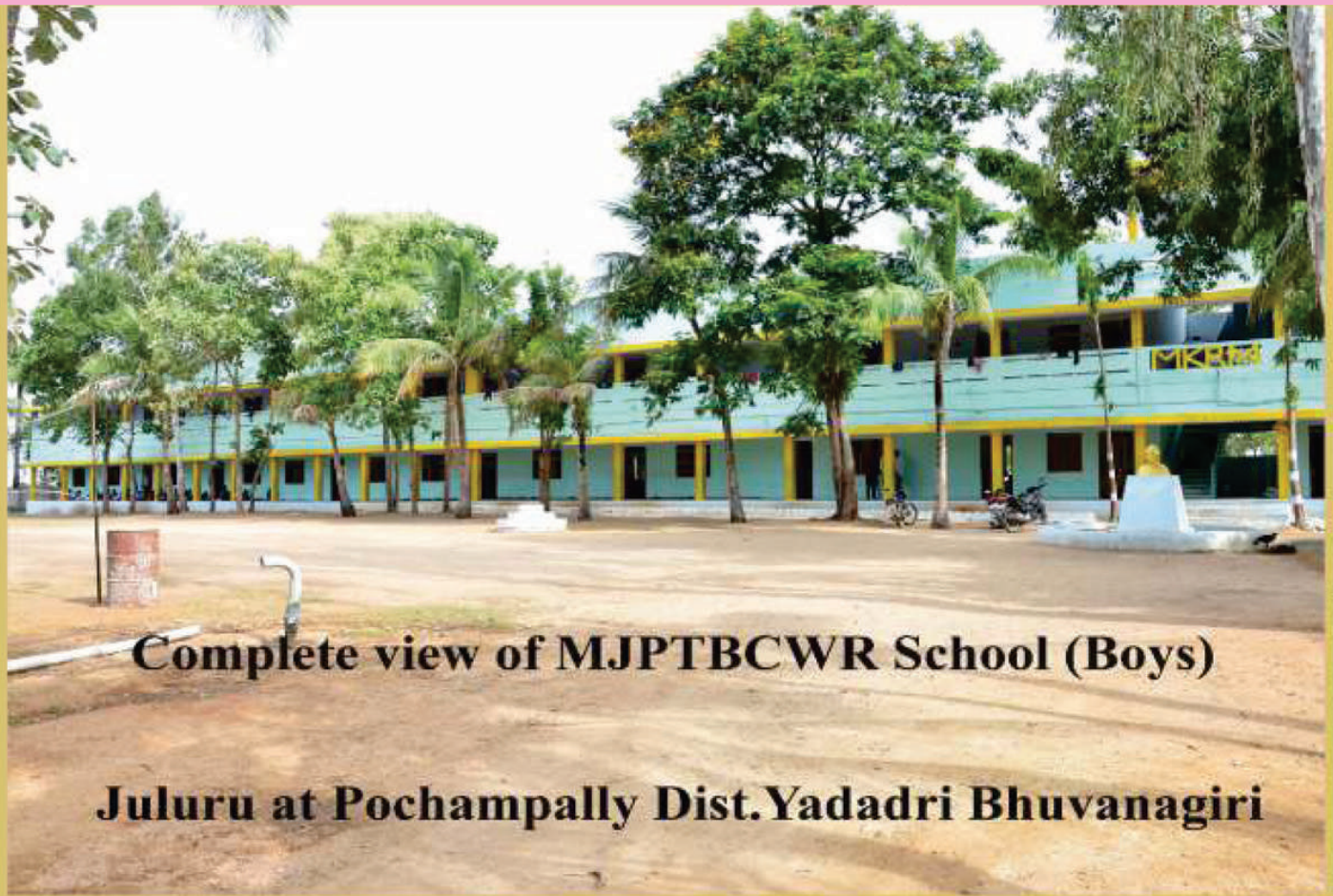
Complete view of MJPTBCWR School (Boys)

Juluru at Pochampally Dist.Yadadri Bhuvanagiri